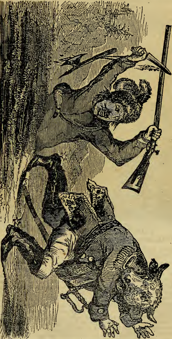
THE GHOST OF CROCKETT SCARING JOHN BULL FROM OREGON.